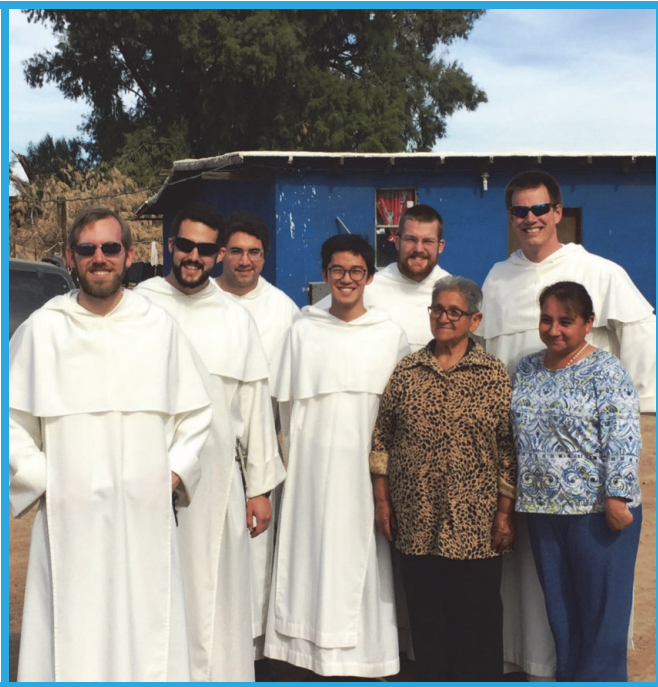
The novices visiting homes in our parish.