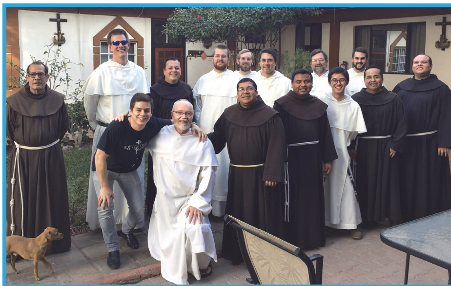
Left, the novices being hosted by the Franciscan Friars of Mexicali. Middle left, looking toward the United States from our parish on the Mexican side of the border.

We must pray so that the hearts of these young people may ... become free ... from the idolatry of vanity, the idolatry of pride, the idolatry of power, the idolatry of money.